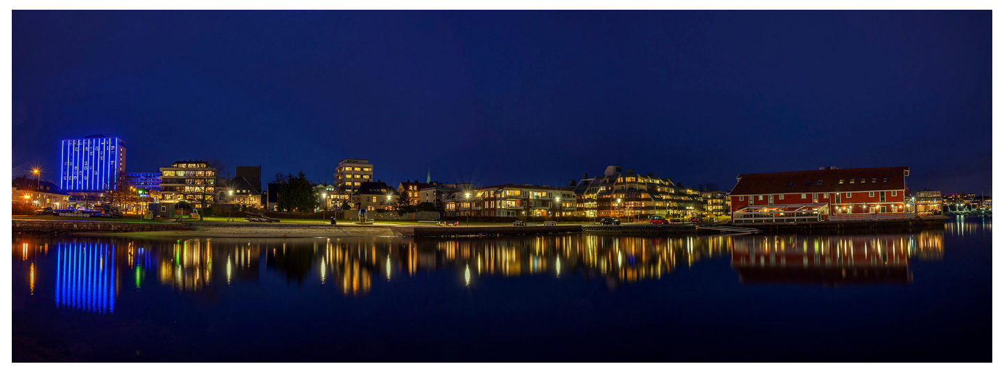
Kristiansand waterfront by night. The conference hotel is to the left.

issue of TOS Forum via the conference website, IM Publications Open and the IPGSA internet portal. In-person conference participants will receive a print copy at the conference.