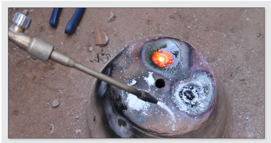
Figure 4. Gold has been concentrated and smelted to a small bead.

enters the food chain. The mercury is thus not only a health risk in the countries where small scale gold miners release it to the atmosphere, but it very quickly creates a global problem.