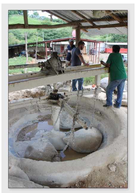
Figure 2. Low tech milling (rastra) with mercury addition (Nicaragua). The boulders mill around slowly for a couple of hours. When milling is complete, the cavity is cleaned of milled ore and mercury amalgamated with gold. The flour floats away.

milling stage. This saves time and work, since this also takes care of good mixing of mercury with the pulverising gold ore, thereby creating the desired gold amalgam very efficiently. When the amalgam is heated mercury evaporates, thus being released to and polluting the environment, leaving the gold behind (Figure 4).<sup>4</sup> The waste, called