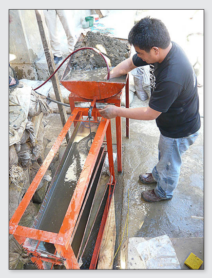
Figure 6. Prototype of "Peter Plates" in action (Philippines). Tailing slurry from the tub is passed over the plates in succession.

reflecting a capacity of only about 100 kg tailings processed per hour, when considering the millions of tons of polluted dumps that today wait to be cleaned, a long-term viable solution still would appear far away.