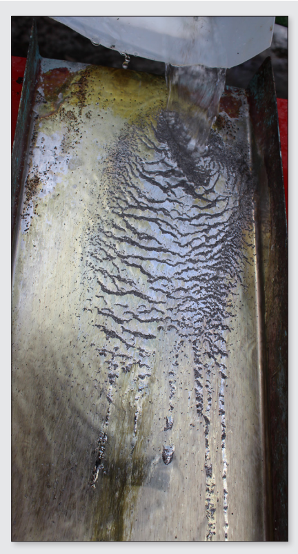
Figure 9. Large amount of mercury captured on Peter Plate (Nicaragua). The plate is about 20 cm wide.

mercury extraction than others? First generation mineralogical investigations have not provided a clear answer,<sup>4</sup> but to date it has not yet been possible to carry out more comprehensive studies due to lack of appropriate funding. The specific comminution/crushing/milling approach further developed, and attendant problemdependent processing times, will likely also play an important role in increasing the degree of recovery.