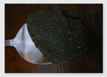
Figure 5. Mercury flour (droplets) in a spoonful of tailings (Philippines).

At first sight, it would seem an insurmountable task to recover the immense number